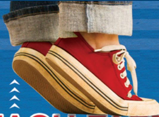
chart a new course