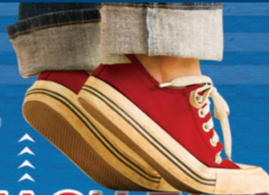
chart a new course