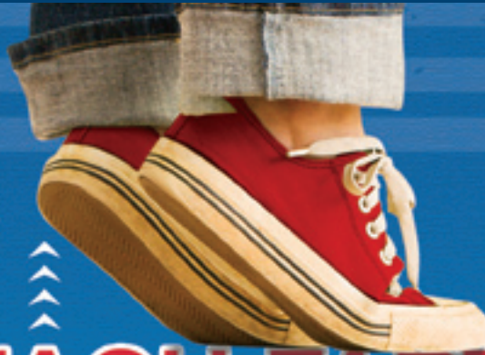
chart a new course